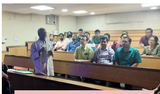
INSTITUTE OF POST GRADUATE MEDICAL EDUCATION AND RESEARCH, KOLKATA