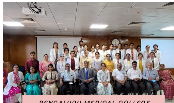
BENGALURU MEDICAL COLLEGE