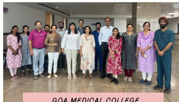
GOA MEDICAL COLLEGE