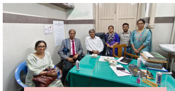
KOLKATA MEDICAL COLLEGE